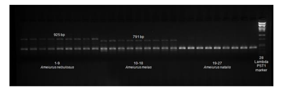
Figure 1. The species-specific fragment pattern amplified by the CytB_L_14724F and Cytbasa_R primers. Lanes from left: (1–9) A. nebulosos ; (10–18) A. melas ; (19–27) A. natalis ; (28) molecular weight marker

Vector specific T7 and SP6 primers were used to sequence 16 clones containing an insert of the proper size from both A. nebulosus and A. melas samples.